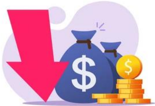
Lack of Financing

According a joint survey between SME Corp and Huawei, the key barriers to SME digitalization are lack of financing , lack of necessary employee skillset and low access to technology .