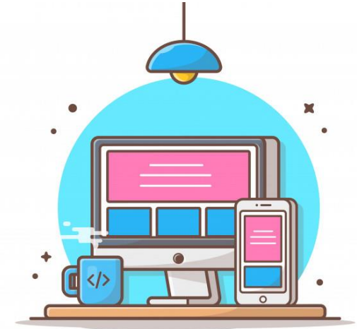
Low Access to technology