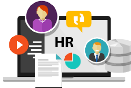
Not having the right employee skillset as a major challenge to digitalization